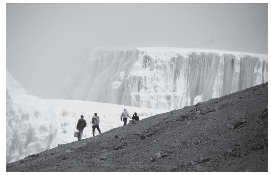
Above: The glaciers may be melting, but they are still big. Opposite page, clock-wise from far left: Campsite at Moir Hut; Eli Fry checking the elevation throughout the ascent—first 4,120 vertical feet to the summit, then 1,900, then 1,340, and finally nearly to the top at 260; a giant lobelia tree— Kili is famous for these; the Trekkers are only 340 vertical feet below the summit. Page 24, left to right: Climbing Great Barranco; the proudest moment—the Philmont flag unfurled on the Roof of Africa. Page 35, top to bottom: Path to cemetery where Baden-Powell is buried; Lee at the gateway to Nyeri cemetery; Rick and Lee with the unfurled Philmont flag over Baden-Powell's grave.

It is estimated that about 40,000 persons a year attempt Kilimanjaro, but many of them do not make it. Some are laid-low by altitude sickness, some succumb to attitude sickness. Some people die in the attempt. The number of deaths a year is a guarded secret, but estimates run from twenty to forty