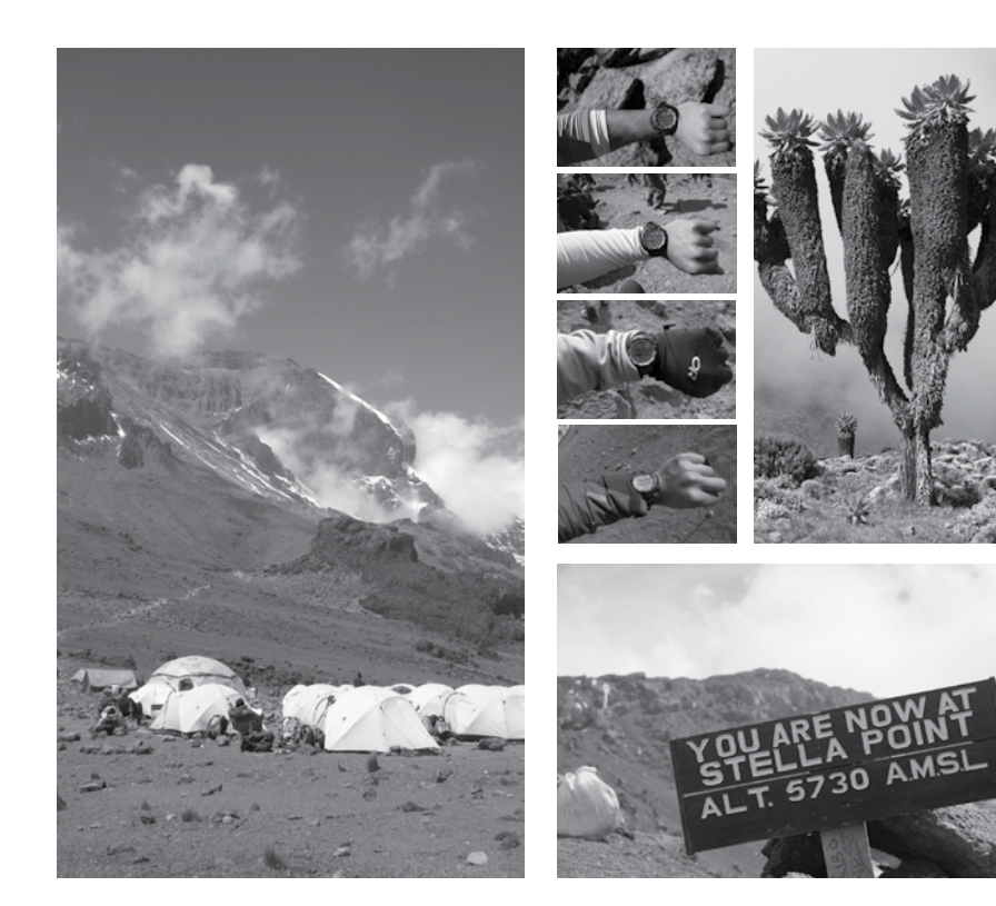
VOLUME 34, NUMBER 5 - OCTOBER 2011