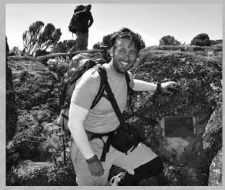
Volume 34, Number 5 — October 2011